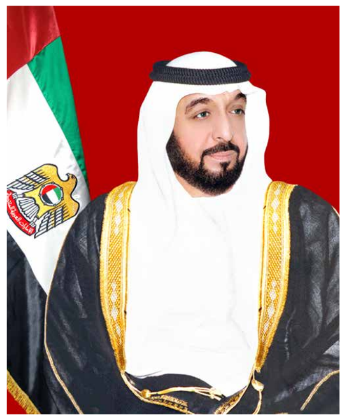
His Highness Sheikh Khalifa Bin Zayed Al Nahyan President of the United Arab Emirates